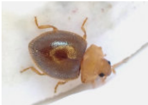
Photo: Top Left Southern Ladybird— Cleobora mellyi ; Bottom Left : Yellow-haired Ladybird— Adoxellus flavihirtus ; Right : Yellow-shouldered Ladybird— Apolinus lividigaster

A medium-sized ladybird I have found several times in Ashhurst is the Yellow-shouldered Ladybird, also from Australia. It is about 4 mm long and is black with yellow shoulders. First found in Auckland in 1961, it eats