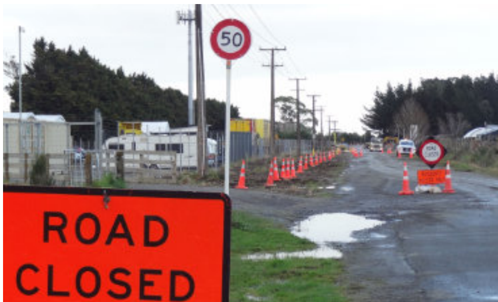
Photo: Road works begin on Custom Street