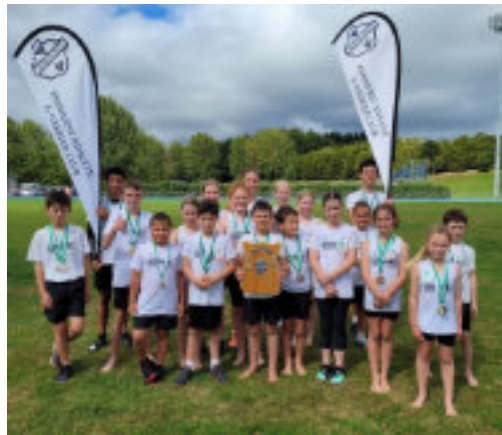
Photo: Ashhurst at the Manawatu Children's Team Champs.