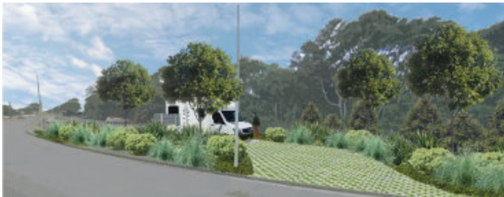
Image: Design view of proposed dump station—Palmerston North City Council

Deadline for November Issue—Friday, 20 th October