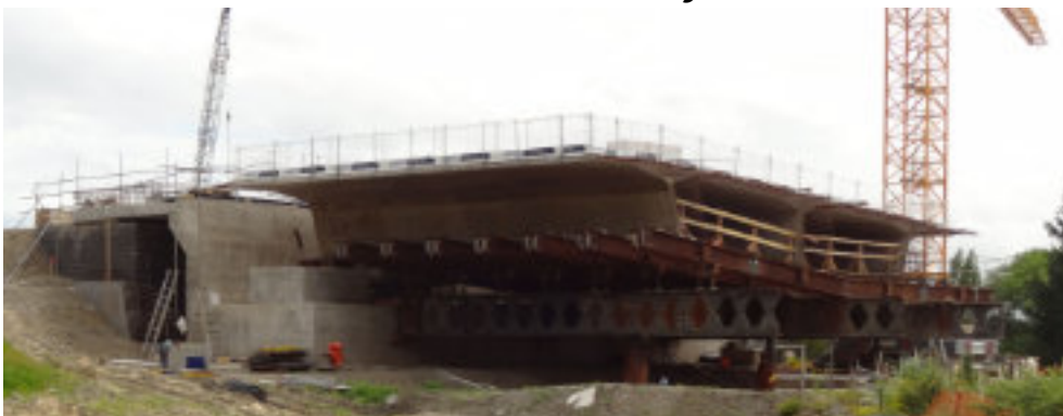
Photo: Construction progress of new bridge at Manawatū Gorge