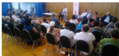
Photo: Attendees at the school bus route meeting

No decisions have been made as yet, but any loss of school bus routes can only result in reduced school attendance and more costs for parents.