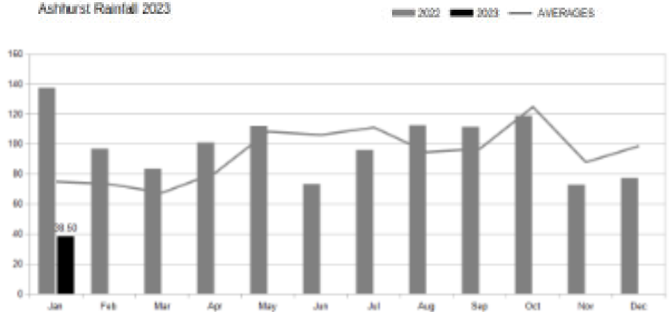
Ashhurst Rainfall 2023