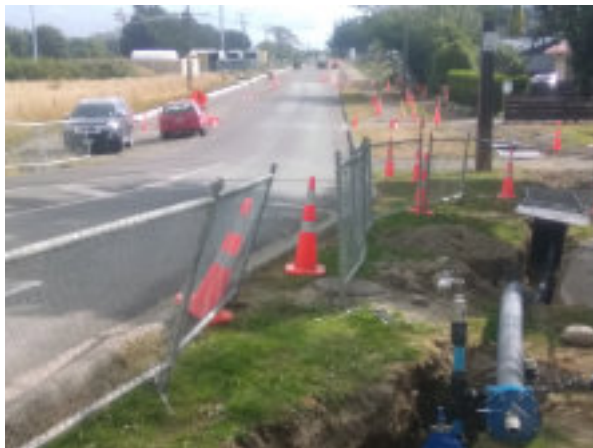
Photo: Ongoing road works in Custom Street