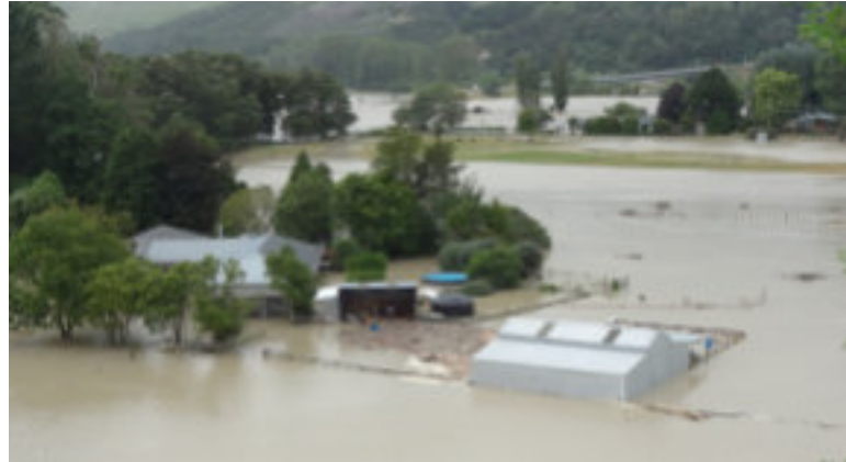
Photo Left: Flooding on Saddle Road; Top: Olsson Orchard; Bottom Saddle Road Bridge.

This all resulted in a very high Pohangina River and loss of the Saddle Bridge, with slips up to 60% of farmland up the Valley. The Ashhurst Stream, which is fed from the Zig Zag Road catchment area, broke its banks near North Street. It then flooded a dozen houses as it detoured down Oxford Street, Winchester Street and Napier Road on its path to join the river at the bottom of Hacketts Road.