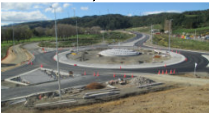
Photo: The roundabout for the new highway.