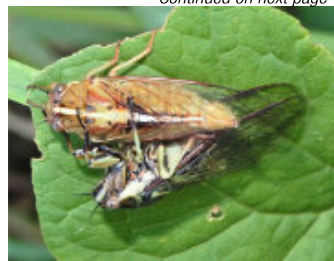
Photos: Left - Chorus Cicada, Right top - Kikihi Cicada, Right bottom - Variable Cicada