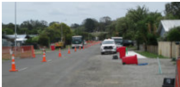
Photo: Wyndham Street upgrades