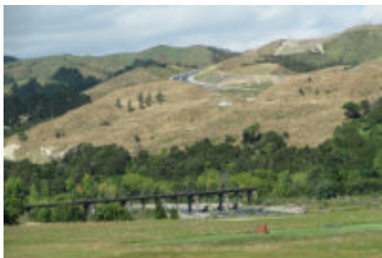
Photos: Left—Road, rail and aerodrome from Ashhurst Domain; Right—View of the new protective flood protection of rocks below the railway bridge.

The draft Reserve Management Plan for the Ashhurst Domain has passed Council's hurdles and should be available for consultation as the Village Voice is distributed. This management plan is an update to the original version established almost 30 years ago and will guide its ongoing development and use. The Ashhurst Domain has various zones for sports, picnics, native bush and so on, which are