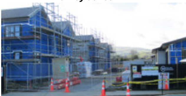
Photo: New Kainga Ora homes under construction in Oxford Street