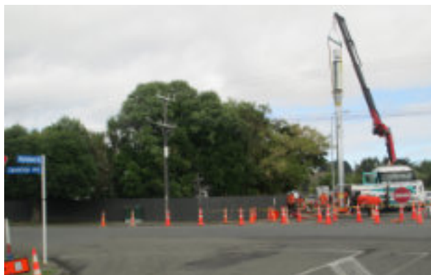
Photo: New cell phone tower Wyndham Street

The Representation Commission has proposed