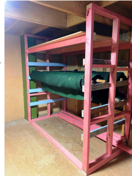
Photo: Storage racks being built in the Village Valley Centre to store Centre equipment.

Club members are looking forward to the new season. The Manawatū Centre has shifted its base to our Village Valley Centre, therefore lots of events will be held in Ashhurst, including the League series which is run from April through to September.