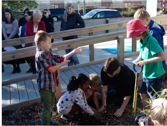
Photos: Māra Rongoā planted at Ashhurst Health Care School tamariki help planting garden.