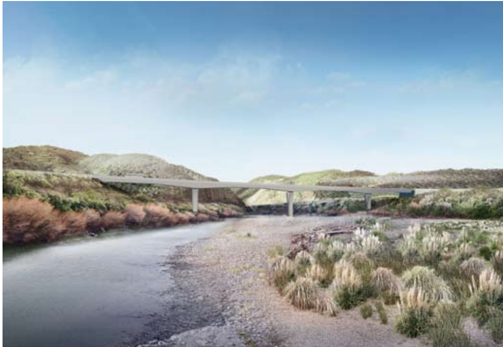
Photo: Bridge from Parahaki Island

Piece by piece, temporary staging has been built across the river to create a platform for the permanent works