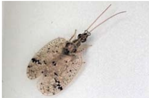
Photos: Left— Heteroconis ornata ; Top Right— Micromus tasmaniae ; Bottom Right Psectra nakaharai

appear to be common locally (I have never found one). I have found several Dusty-winged Lacewings, however, of which there are two species in New Zealand, both introduced. One of these is Heteroconis ornata (see photo). Dusty-winged Lacewings are white or white with dark grey markings on their wings.