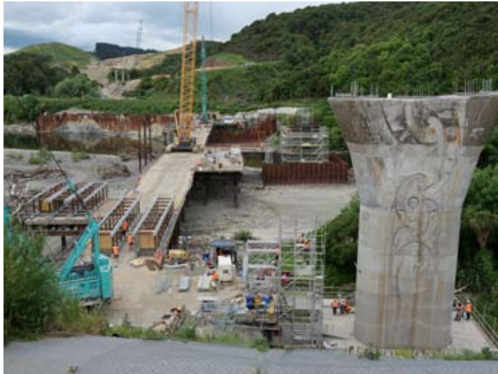
Photo: Pier 1 has been completed on the Parahaki Bridge over the Manawatu River.

Applications are open until March 2025, if not awarded prior. For details about the application criteria and how to apply, go to www.nzta.govt.nz/projects/te-ahu-a-turarua/publications .