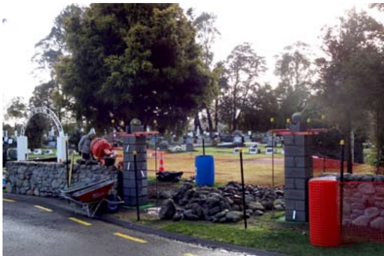
Photo: Construction of rock gateway at Ashhurst cemetery