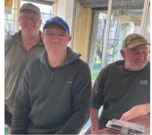
Right: Winners of the day.