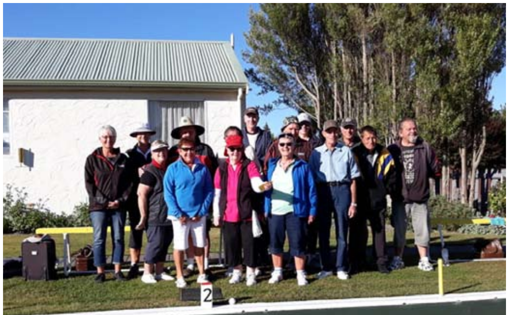
Photo: Players in the 2x4x2 Challenge on 19th March